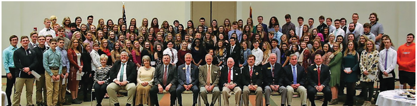
128 high school seniors across the Amicalola EMC service area each received a $1,000 scholarship, shown here with the Amicalola EMC board of directors at the 2017 Youth Awards Banquet held in March.